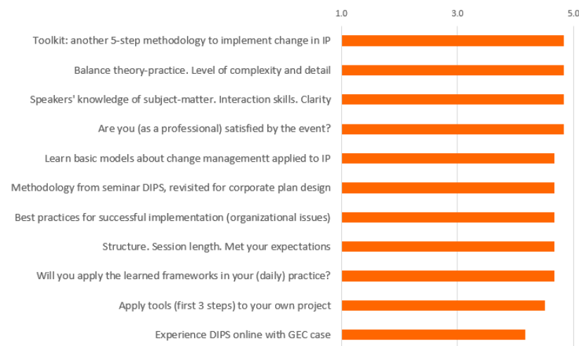
Customer satisfaction ranging from 1 (very poor) to 5 (very good)